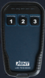
Remote Control KIT17FJERNB