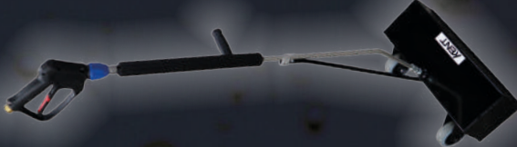
Lance with 40cm nozzle blob and wheels 046075