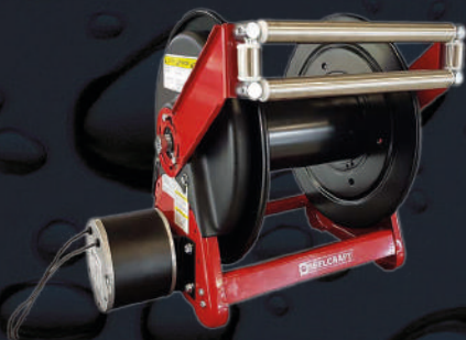
Electric Hose reel KIT18SLRUL